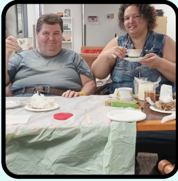
Cookie decorating & tea party