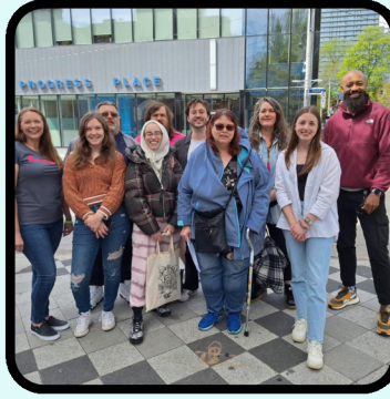
Colleague Training at Progress Place Clubhouse: Toronto, ON