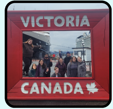
Geocaching in James Bay